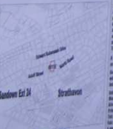
Locality plan of proposed electrical substation